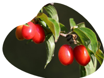
Cornus Officinalis Fruit