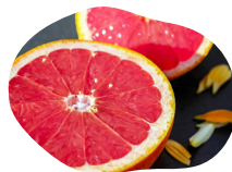
Citrus Paradisi (Grapefruit) Peel Oil